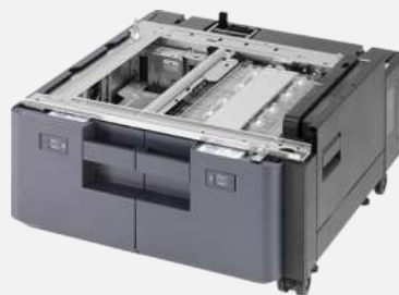
2x 1500-Sheet paper feeder PF-7110

Ideal for paper sizes between A6 and SRA3 (320 x 450 mm).