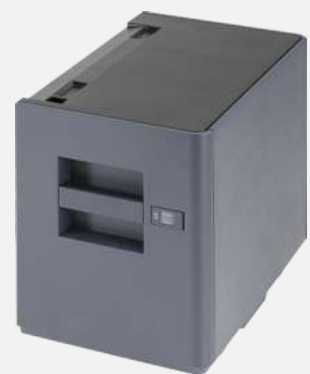
3000-Sheet paper feeder PF-7120