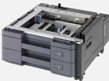
2x 500-Sheet paper feeder PF-7100

2 x 500 sheets, ideal for paper sizes between A6 and SRA3(320 x 450 mm).